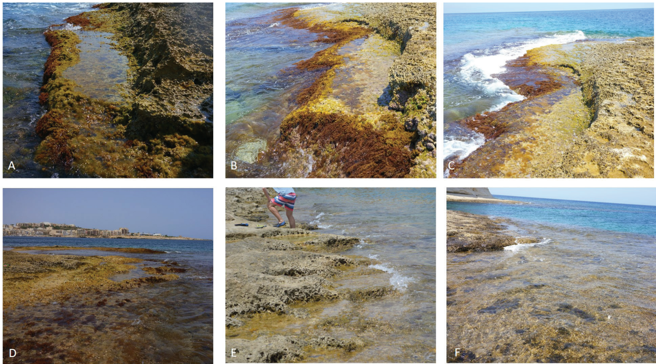
Fig. 2: Photos of the vermetid typology trottoir recorded at sites 6 “Malta Film Studios” (A), 7 “Dawrett x-Xatt” (B), 8 “Żonqor” (C) and 9 “Jerma” (D), crust at sites 10 “Kalanka” (E) and 19 “Marsalforn” (F).

On Gozo, vermetid bioconstructions were recorded at six sites, specifically at “Xatt l-Aħmar”, “Dwejra”, “Reġġa”, “Marsalforn”, “Dahlet Qorrot” and “Xwejni Beach” (Fig. 1). “Marsalforn” was the only Gozitan coastal site selected for further qualitative measurement and quantitative analysis. At the northeast extremity of Marsalforn Bay, an abrasion platform colonized by crusts of vermetids was recorded, extending over a maximum width of 7 meters and being subjected to seasonal trampling disturbance due to its popularity for bathing (Fig. 2F).